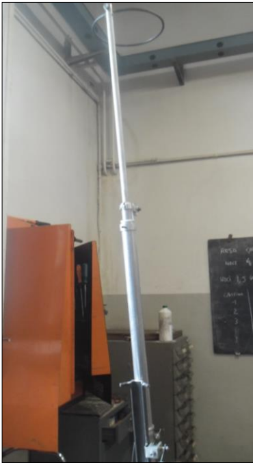
Fig. 2. 1:3 scale of harvester