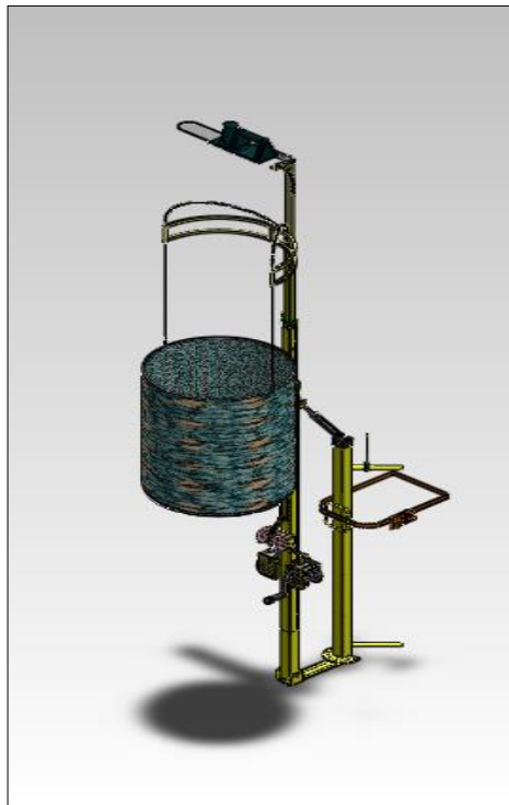
Fig. 1. The designer of a dates cluster harvesting machine

Theoretically, one operator is sufficient to run the machine, but makes it easier for the existence of an assistant is needed.